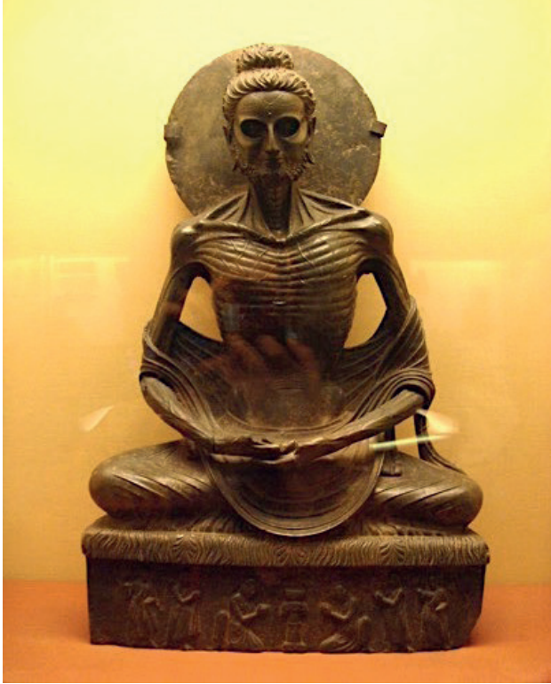
Figure 6. 'The Fasting Buddha' on display in the Gandhāra Gallery at the Lahore Museum.

dark wood. In order to better understand these artefacts and the various meanings they have held in the past and generate today, we need to go back to a time when, as the so-called 'founder of Gandhāran Studies' Alfred Foucher, stated: '... the oldest known Buddhas are those which we have encountered in the "House of Marvels," as the natives call the museum of Lahore' (Foucher 1917: 117-18, cited in Abe 1995:74).