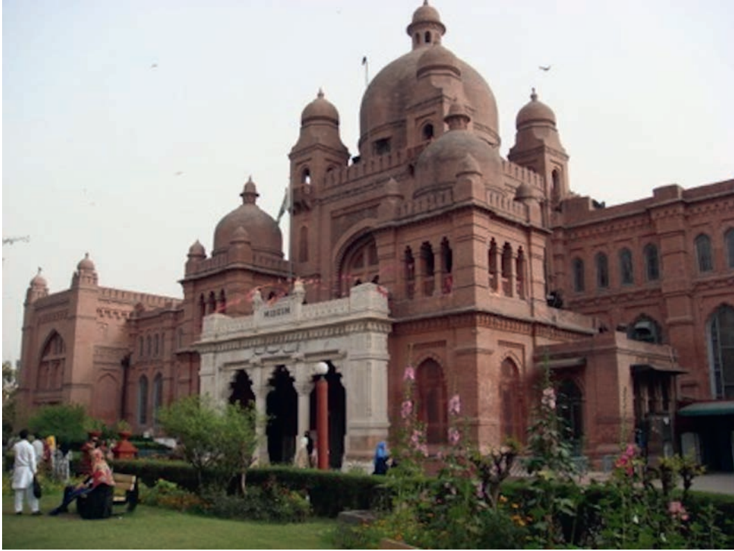
Figure 1. The Lahore Museum.