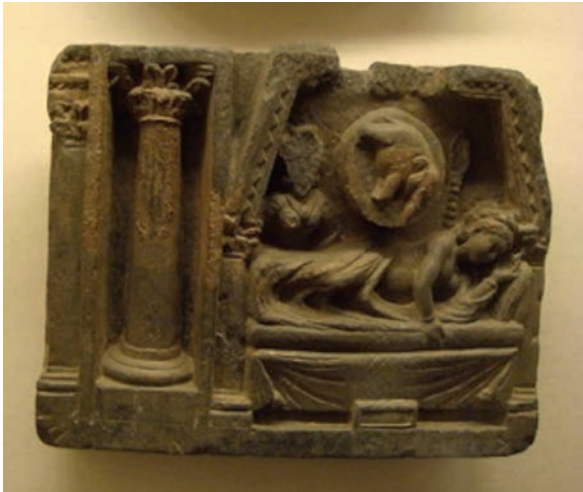
Figure 4. Jātaka of The Dream of Queen Maya in the Gandhāra Gallery at the Lahore Museum.