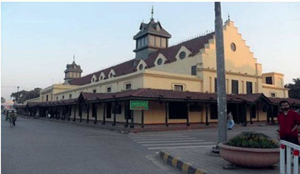
Figure 9. The building popularly known as Tollinton Market, Old Anarkali, Lahore that was the site of the 1864 Punjab Exhibition and Lahore Central Museum (1864-1894).