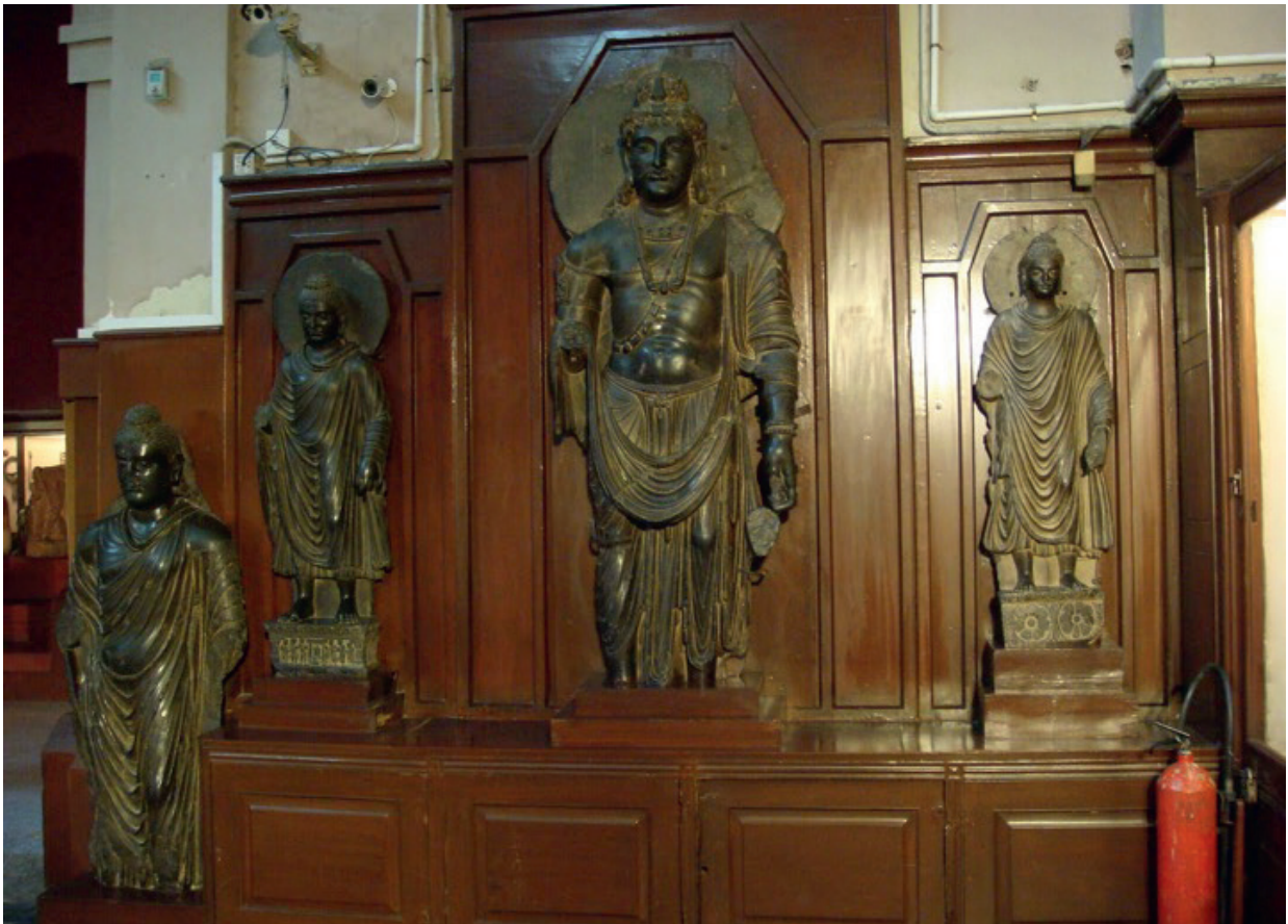
Figure 7. An Open Display of Gandhāra in the Gandhāra Gallery at the Lahore Museum.

dark wood. In order to better understand these artefacts and the various meanings they have held in the past and generate today, we need to go back to a time when, as the so-called 'founder of Gandhāran Studies' Alfred Foucher, stated: '... the oldest known Buddhas are those which we have encountered in the "House of Marvels," as the natives call the museum of Lahore' (Foucher 1917: 117-18, cited in Abe 1995:74).