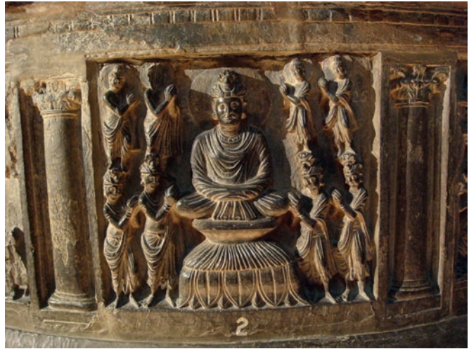
Figure 3. (a) Sikri Stūpa in the Gandhāra Gallery at the Lahore Museum. (b) Detail of panel of the Sikri Stūpa.