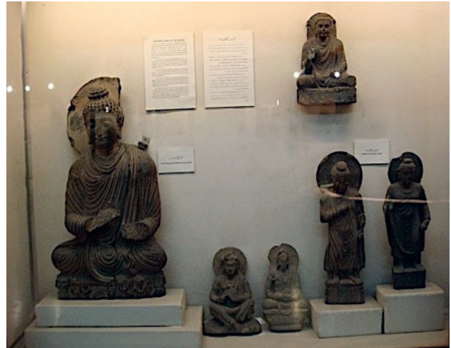
Figure 5. Display Case exhibiting sculptures of bodhisattva/the Buddha in various poses in the Gandhāra Gallery at the Lahore Museum.

Today, the gallery is dominated by the Sikri Stūpa (Figures 3a and 3b) that sits in its centre, lit from below to illuminate the relief-work on the drum with a descriptive note on a stand for those interested to learn more. One side of the gallery tells the life-story of the Buddha as depicted in the jātaka ‘scenes’ (Figure 4) executed in stone relief – from pre-incarnation to enlightenment and finally death. Other cases in the gallery hold statues and busts of bodhisattva and Buddha in various poses (Figure 5) with the most prized being the ‘Fasting Buddha’ (Figure 6). The Buddha image dominates the gallery and is available for close inspection in the eight sculptures on open display along the western wall (Figure 7). Stucco and terracotta heads (Figure 8) provide some colour in what is otherwise a heavy gallery of grey schist and