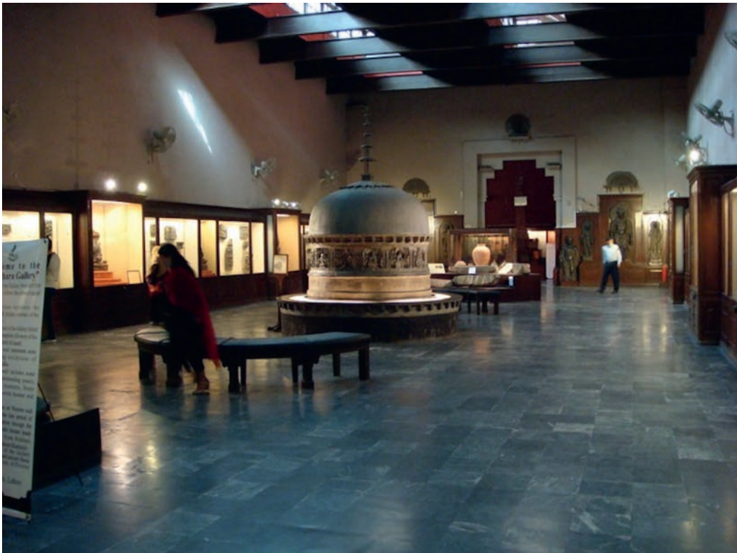
Figure 2. The Gandhāra Gallery at the Lahore Museum.