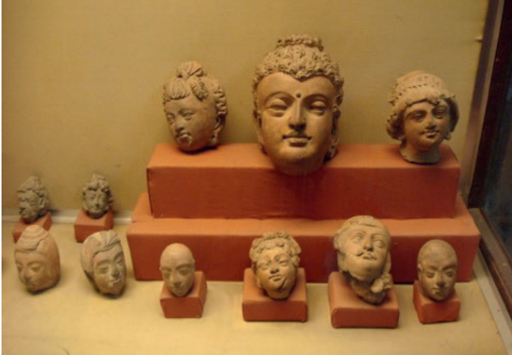
Figure 8. Stucco and terracotta heads from Gandhāra on display in the Gandhāra Gallery at the Lahore Museum.