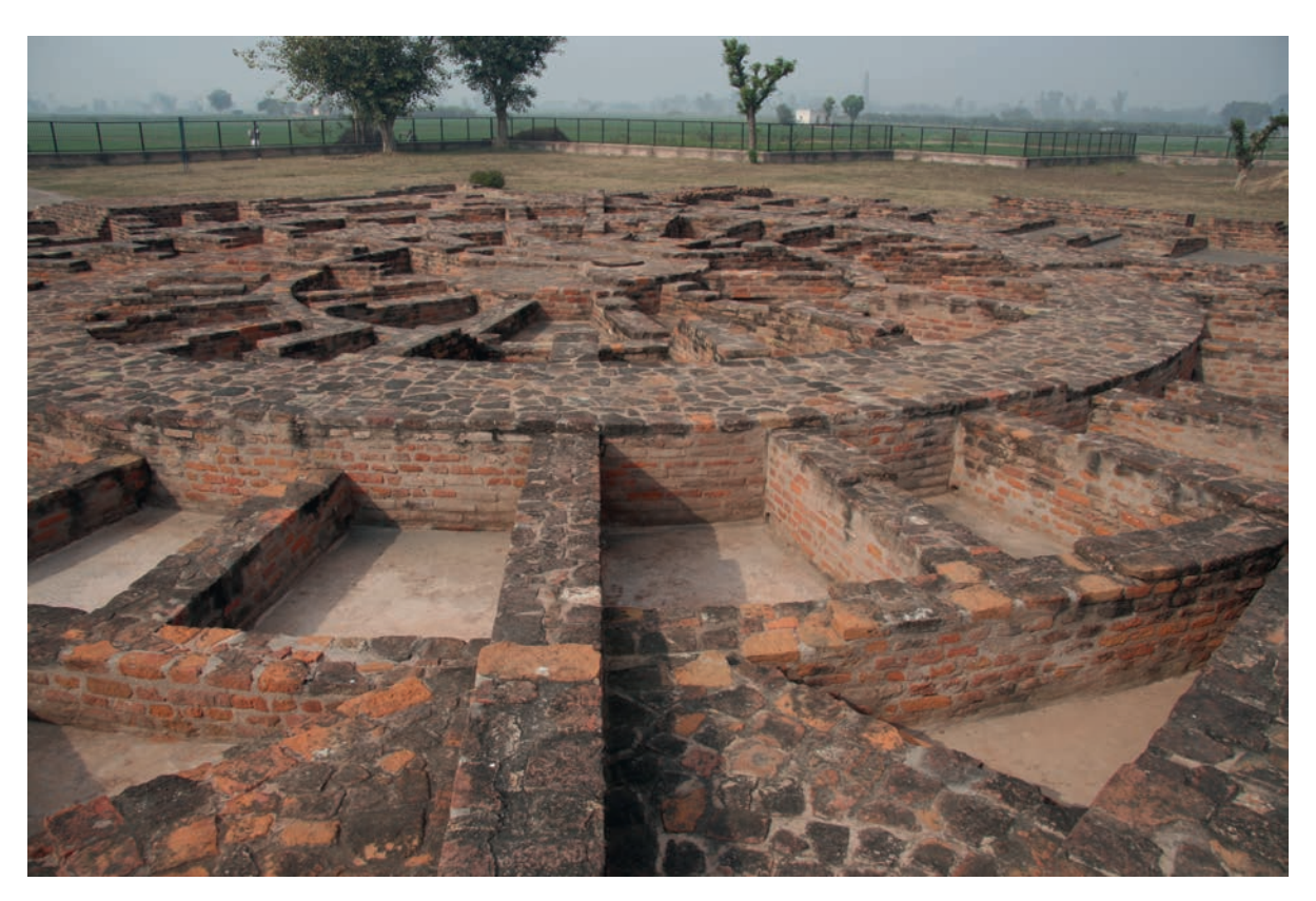
Figure 3. Main wheel-shaped stūpa in SGL-5 at Sanghol.