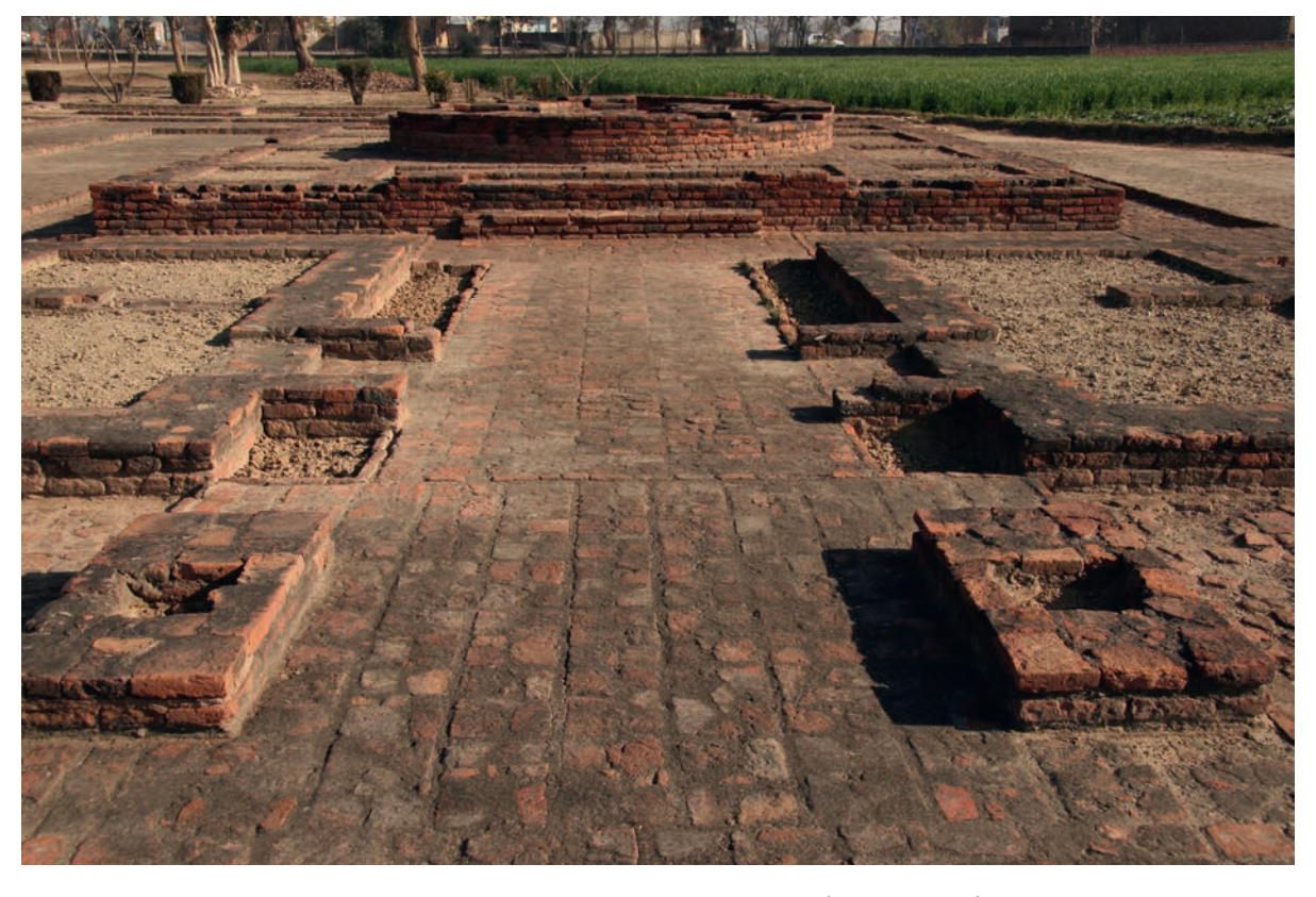
Figure 4: Stūpa complex at SGL-11 at Sanghol.